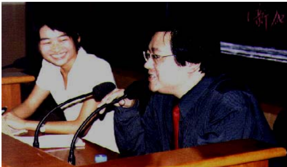
Replying to questions by students in Mandarin